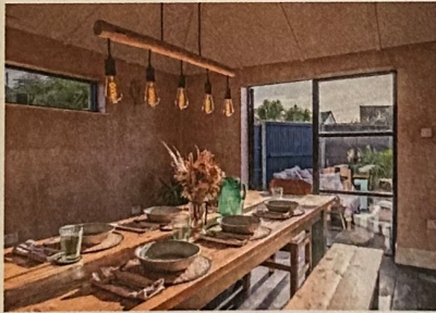
Whitehouse treats (below); kitchen goals!

EXPLORE The glorious sands of Camber beach stretch for miles, and scrambling up the dunes is a must. The town itself is less pretty, but new lifestyle shop/deli/coffee bar Camber Landing serves negronis, £9, alongside handsome pastries and