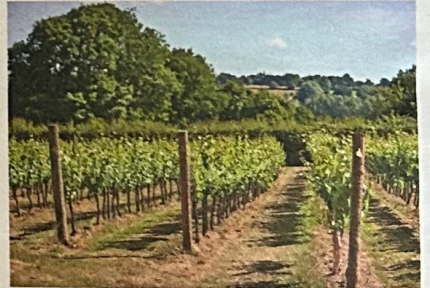
Camber's dunes (top); wine-d down at Chapel

quiches, £3.75. There are three vineyards within half an hour's drive, too. Stroll around Chapel Down on an entertaining tour, before trying its moreish Bacchus white wine. Tours with tastings cost from £30 per person (Chapeldown.com).